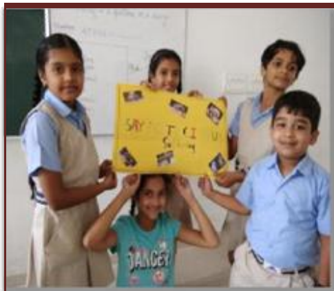
Science Activity Say no to Plastic