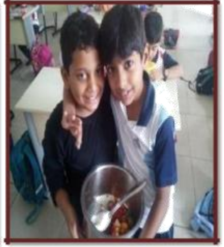
Science Activity Stay Healthy and Human Digestive Organs