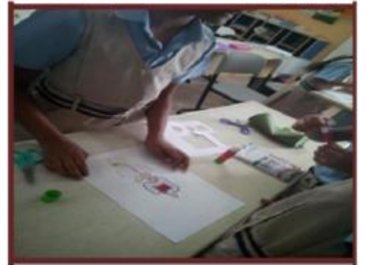
Social science Activity Collage Making