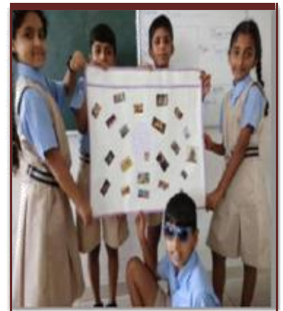
English Activity Poster Making