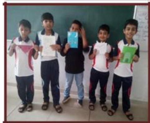
Book Mark Making